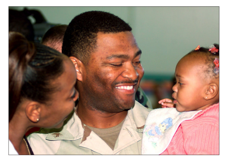
By Training and Doctrine Command Public Affairs Office April 2003