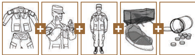
Permethrin on Uniform