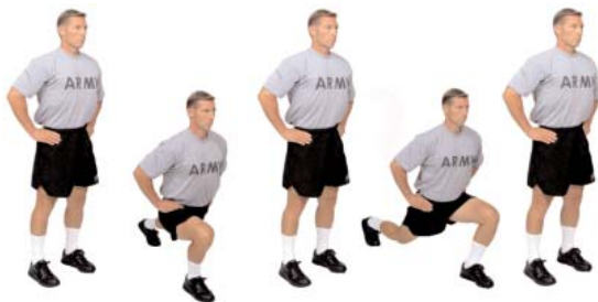
Starting Position Position 1 Starting Position Position 3 Starting Position