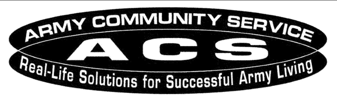
Figure 3–1. Army Community Service emblem

b. Identification signs will be prominently displayed on main roads on the installation to help newly assigned Soldiers, civilian employees and their Families locate the center.